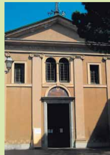
The Church of Pescarenico

is the original furniture and in the centre a precious lamp bought by Giulia Beccaria. Room 8 was the dining room, with a fire that sent warm air into the environment and a ceiling that was decorated with refined stucco work. A notice board/showcase presents a sampling of the boundless repertoire of Manzonian curiosities. Room 9 is dedicated to the first printed edition of "Promessi Sposi", the so called 'Quarantana' and its publishing sequence. Manzoni himself wanted the edition to be richly illustrated and he took great pains with the image of the book, like a real film before release. The last and most atmospheric part of the villa that is possible to visit, are the cellars with a splendid ice house and two original torches from half way through the 19th century. On the first floor of the villa there is the Galleria Comunale d'Arte (the City Art Gallery) which displays work by local artists from Lecco, from the 17th century to the present day.