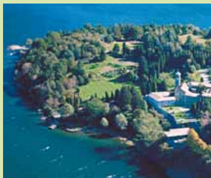
The Abbey of Piona