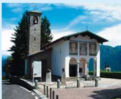
The Sanctuary of Madonna del Ghisallo

Open every day. Free entry For information tel. 031965710