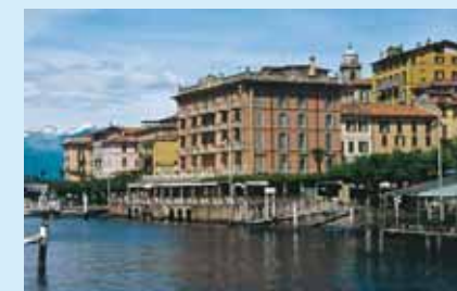
The lake side of Bellagio

www.bellagiolakecomo.com - www.bellagiocomune.it