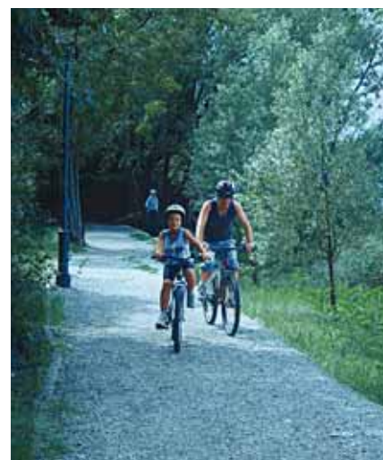
Cycling along the side of Lake Pusiano

The course is dedicated to art and history lovers, because of the diffuse presence of historical buildings of great quality, which refer to all periods in History, from pre Christianity to the early 20th century, with numerous examples of the overlapping of styles verified with the passing of time. The itinerary allows the discovery of the region, through an introduction to its cultural assets, that testify the past, historically, artistically and industrially. Among the most significant monuments and assets which concern the identity of the place and which we recommend you visit are: