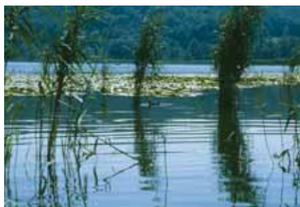
Games of light in the swamp

Parco del Valle del Lambro and by PLIS of the Brughiera Briantea and of the Lake Segrino. The naturalistic course of the morainic lakes represents a unique occasion to spend a relaxing day out in the countryside.