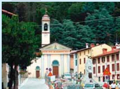
Picture of the village