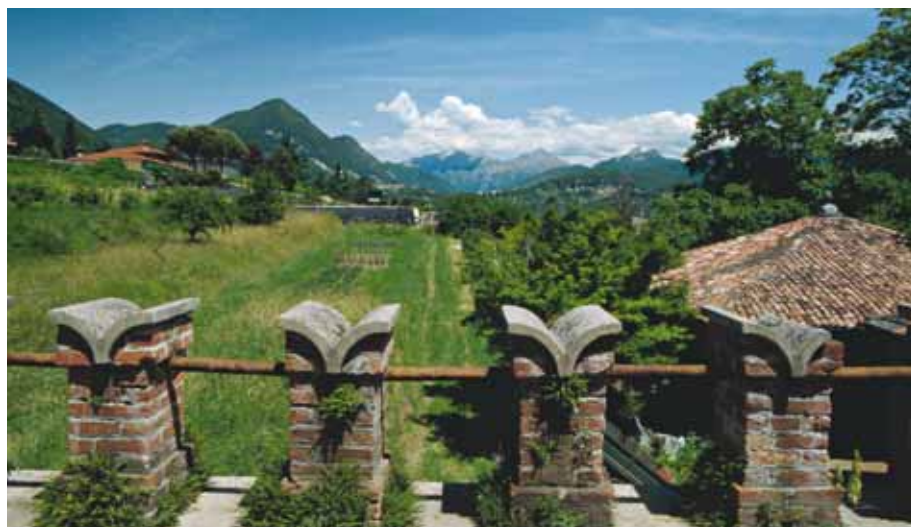
View from Villa Amalia

The course represents the initial part of a much longer itinerary that links the City of Como with that of Lecco, crossing the minor morainial lakes of Brianza (link with itinerary 7)