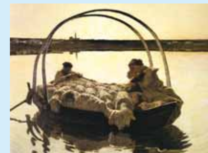
"Ave Maria a trasbordo", painting by Segantini