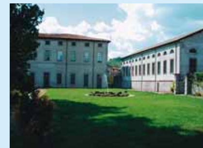
Picture of Palazzo Beauhamais