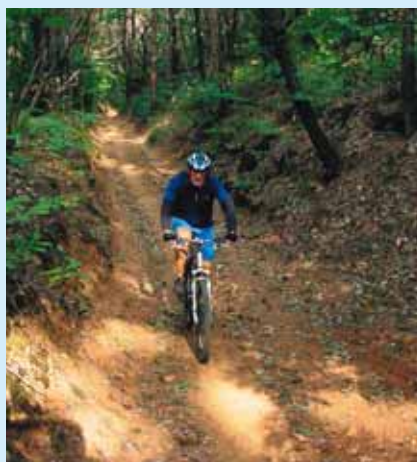
Cycling inside Parco Pineta

For information relating to the organisation of guided visits and educational environmental programmes, then contact the Park Office via Manzoni, 11 22070 Castelnovo Bozzente (CO) tel. 031988430 - fax 031988284 e-mail:parcopineta@libero.it Maps corresponding with the appropriate paths, will be distributed from the park office.