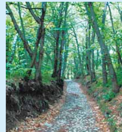
Picture of Parco Spina Verde

via Monte Sasso - Cavallasca - tel. 031536532