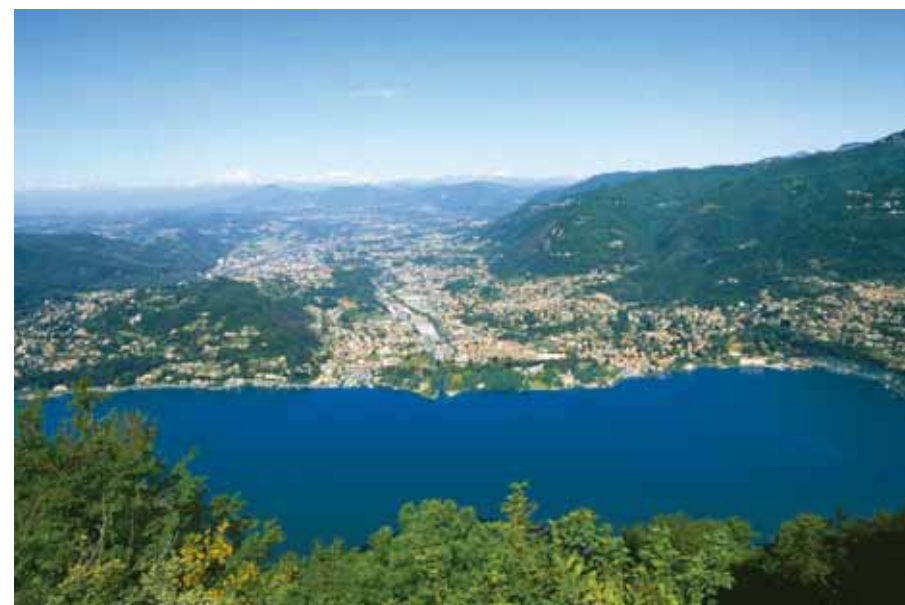
Cernobbio and the Valle del Breggia

and excursions make the course particularly attractive, even just a healthy bike ride in the countryside can encourage tourists to take part in this course, which allow easy connection to two protected areas, on existing paths. The itinerary also offers the possibility of doing other sports that bring you in direct contact with nature and in particular Horseriding, thanks to the numerous sequence of riding schools along the course. We recommend you visit the following parks :