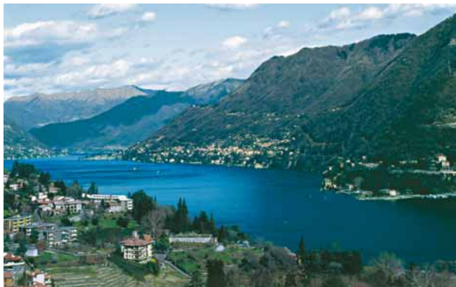
Panoramic view of Lake Como

di Sant'Abbondio , is valuable, and painted on two sides by Morazzone (1608-10). Next to the main façade of the Cathedral is the Broletto , the ancient municipal palace, built under the power of Bonardoda Codazzo in 1215 (which was re-structured as the church progressed). Other buildings that should be seen are the Casa del Fascio , inaugurated in 1936, designed by Terragni, which is a powerful example of rationalist architecture and the Tempio Voltiano , designed by the architect Federico Frigerio (1873-1959). It was built with the intention of conserving and displaying scientific instruments and Volta's manuscripts, except that the copies and the instruments were destroyed in a fire in 1899, during the Great Voltian Exhibition, which was put on to celebrate the centenary of the battery.