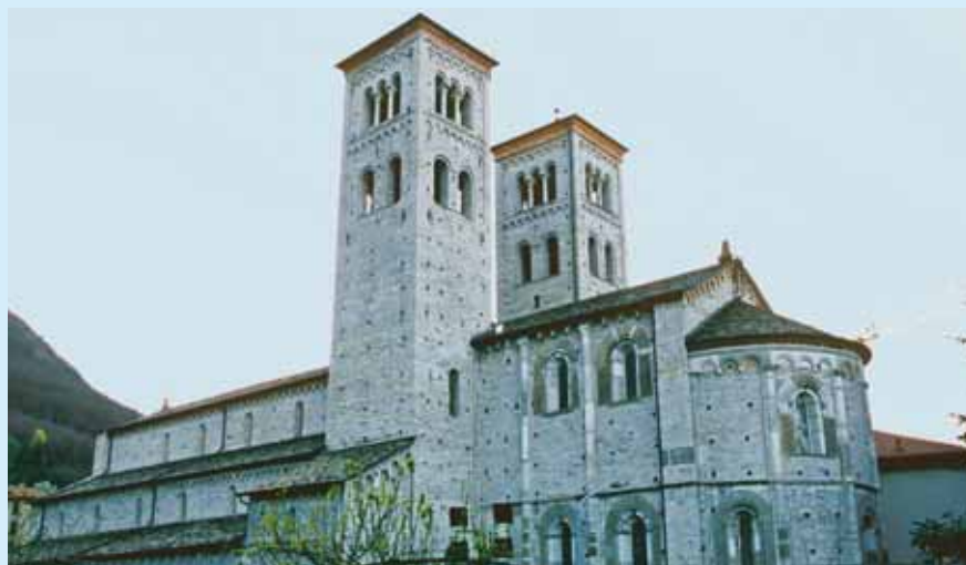
The Church of Sant'Abbondio

The side naves are surrounded by stone columns, most of which are from Roman time. Some are monolithic, made of granite (with the exception of one which is made of cipolin).