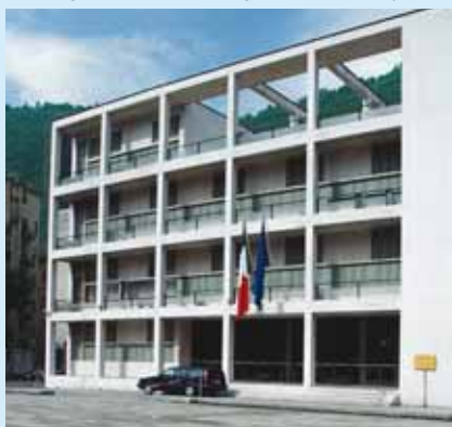
The former Casa del Fascio

in pure colour. There were panels in coloured cement, mounted on iron canvases, alternated with propaganda posters and empty spaces. The buildings number among the most important