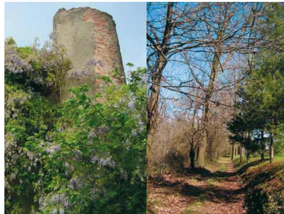
Ruins and views at Parco Pineta

In particular we recommend that you visit: