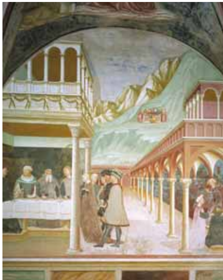
“The banquet of Herod” Baptistery

middle of the countryside. The tower, which was the first of the buildings, was originally built for defence reasons. It dates back to the Gothes period (5th-6th century) and preserves interesting frescoes from the 18th century, which came about when it was transformed into a chapel. Shreds of frescoes, and some tombs, came to light also in the Church of Santa Maria (11th century), in simple poor architecture, which is very different from the refined Romanesque apse. Not far from