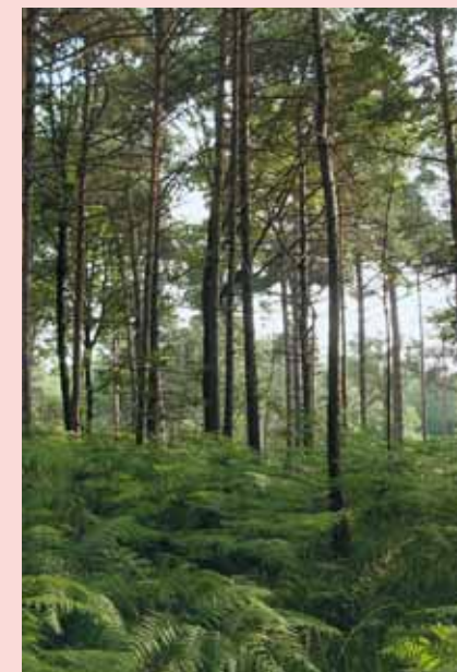
The vegetation of the Park

Information: for information regarding guided tours and educative environmental programmes, contact the park office sede del Parco in via Manzoni, 11 - Castelnuovo Bozzente (CO) tel. 031988430 - fax. 031988284 e-mail: parcopineta@libero.it