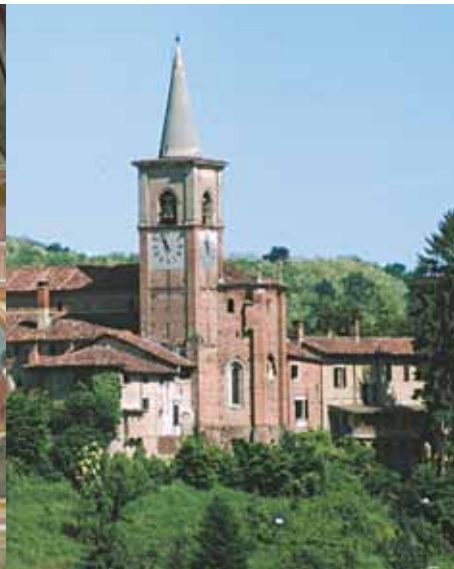
The village of Castiglione Olona