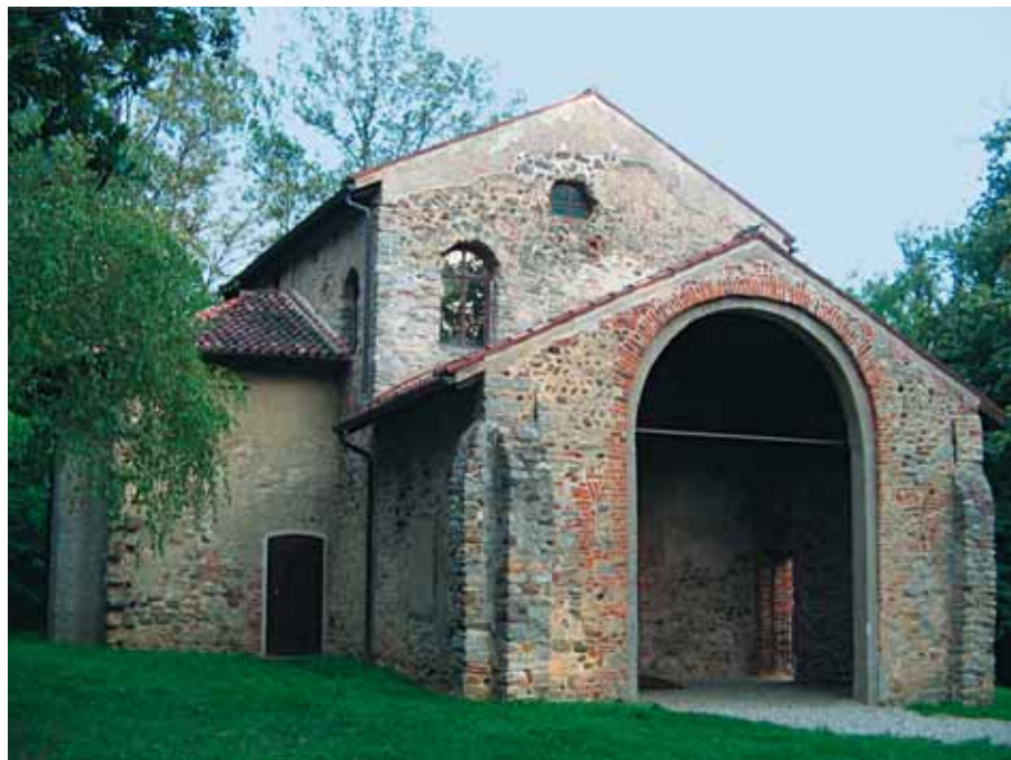
The Church of Santa Maria Foris Portas

Church of Santa Maria Foris Portas – that can be dated somewhere between the 6th and 9th century. It contains one of the most important series of frescoes of early Medieval Europe. Returning to Castiglione Olona the route can be picked up again crossing the town of Venegono Superiore and Inferiore, from where you enter the areas that have the Parco della Pineta in Appiano Gentile and Tradate. Continuing in the direction of Como you reach the town of Castelnuovo Bozzente, where the park office is sited and where the itinerary ends.