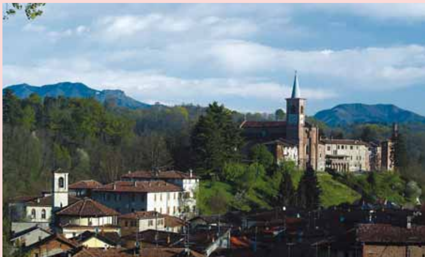
Castiglione Olona – the Collegiata Church

between 1421 and 1441, under the orders of Branda Castiglioni (1350-1443). He was the papal viceroy and an important diplomat and then became Bishop and lately Cardinal of Piacenza. He gave the reconstruction work to important artists of the time such as Masolino da Panicale, a key figure in the transition from International Gothic to Renaissance, who also left two of his most celebrated series of frescoes in the Collegiate and in the Baptistery. Other important artists were Lorenzo Vecchietta and Paolo Schiavo who brought to Castiglione Olona the innovation of Tuscan art. In this way, the town can be considered one of the 'Ideal cities' of the Renaissance period, even though the compact building substantially recalls