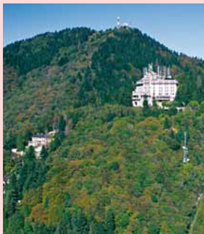
The hotel at Campo dei Fiori

In our area, the pivot of this stylistic and cultural system is without doubt, Varese, with significant ramification towards Campo dei Fiori, Ponte-Tresa, Lago Maggiore, of which the hotels at Campo dei Fiori and the Birreria Poretti are two significant examples.