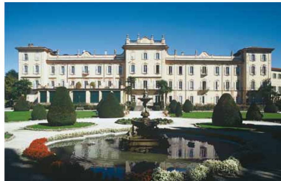
Villa Recalcati in Varese