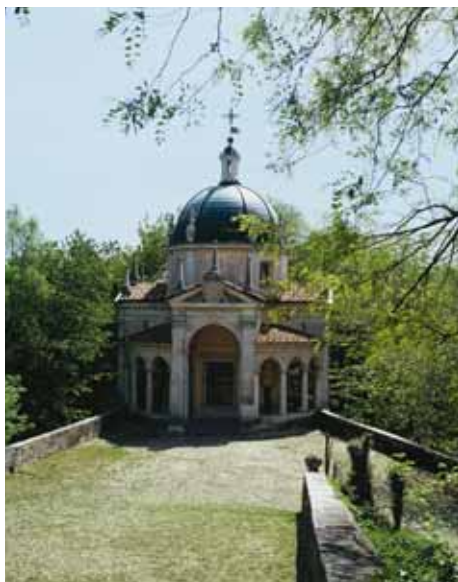
The Fourth Chapel of Sacro Monte