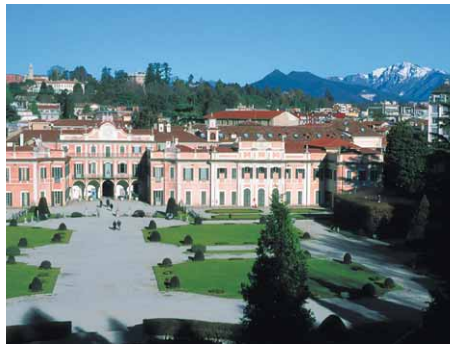
Palazzo Estense and part of its gardens

tel. 0332744707 - e-mail: ufficio@progavirate.com