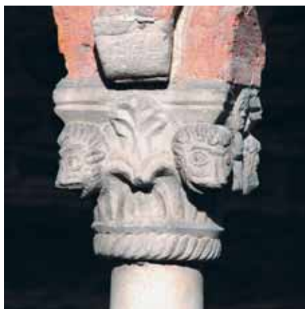
A capital inside the Cloister of Voltorre

hand, represented by the Palude Brabbia , a marshy area of important environmental value. The route represents a unique occasion to spend a relaxing day surrounded by nature.