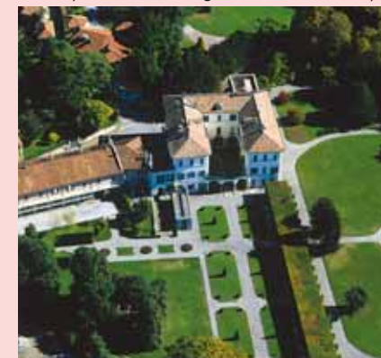
Villa Menafoglio Litta Panza

park was designed at the beginning of 1800 according to the English rules for gardens, combining geometrical style gardens with some more romantic ones. In the same century a new building in Neoclassical style