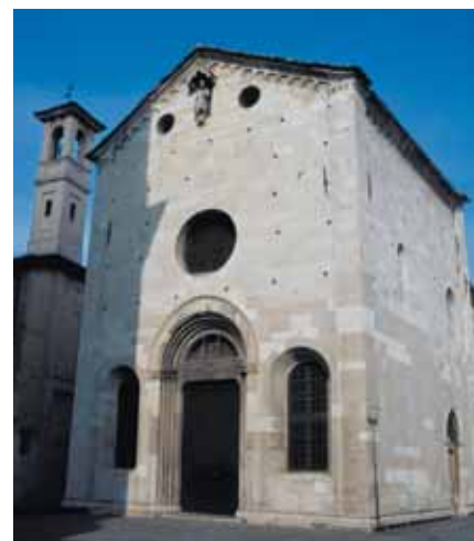
The Baptistery of San Giovanni

Palazzo Estense e Villa Mirabello: Palazzo Estense with its garden was created by the