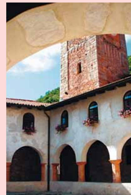
Abbey of Ganna

Accessibility from the cycle route: detour from Maglio di Ghirla 3 km, flat Information: www.badiadiganna.it - tel. 0332994532