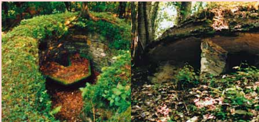
The Cadorna Line

Information: Town Hall of Cassano Valcuvia tel. 0332995519 www.provincia.va.it/lineacadornavarese