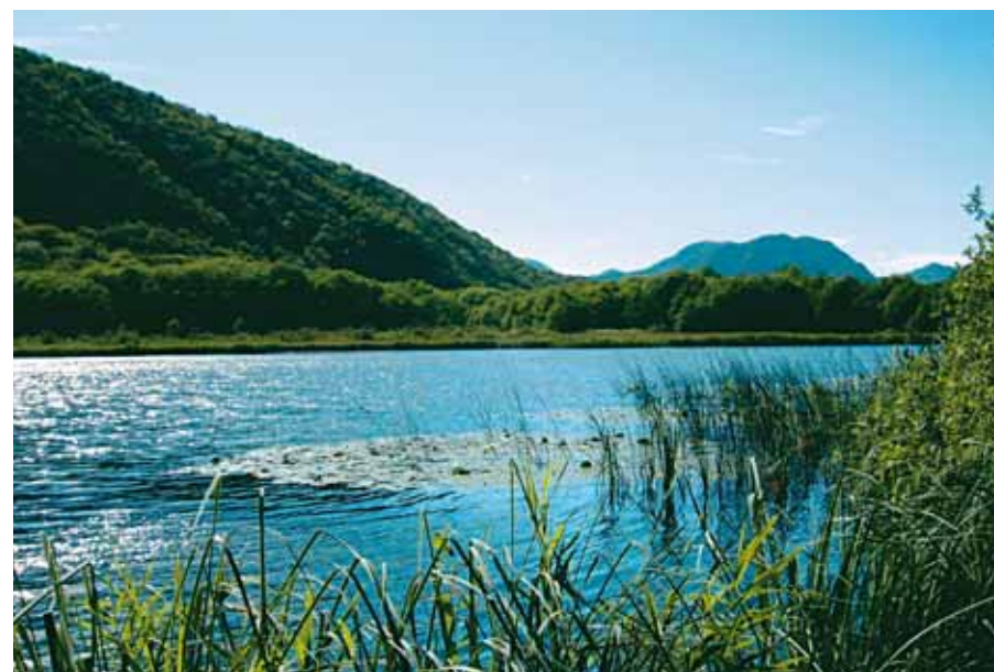
The protected area of Valganna

Tourist Information Office of Gavirate Piazza Dante, 1 - Gavirate tel. 0332744707 - e-mail: ufficio@progavirate.com