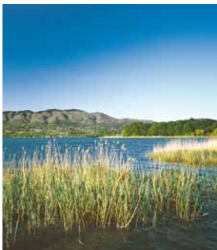
View of Lake Varese from Cazzago; on the background Parco Campo dei Fiori

So a productive tradition began that spread in the high Varese area. In 1796 the ceramics of Camillo Adreani grew famous, spreading the tradition of the renowned 'blu di Cunardo' or 'blu di Ghirla'. In 1896 there were four ceramic factories in