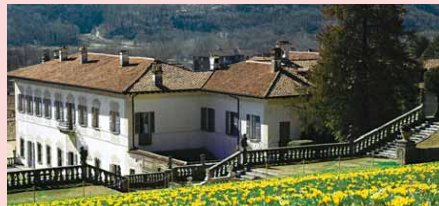
Villa della Porta Bozzolo

Information: Villa della Porta Bozzolo Casalzuigno (Varese) tel 0332624136 - fax 0332624748 www.fondoambiente.it/luoghi e-mail: faibozzolo@fondoambiente.it Guided tours can be organised for groups of up to a maximum of 25 people, only with prior booking.